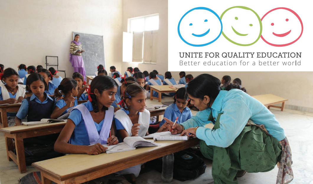
Girl School in Jaipur, India

The purpose is to demand that inter-governmental agencies, governments and public education authorities everywhere put in place the three essential elements of a quality education: