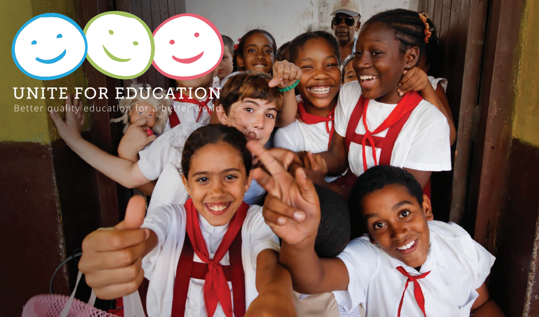
La Havane Cuha

The purpose is to demand that inter-governmental agencies, governments and public education authorities everywhere put in place the three essential elements of a quality education: