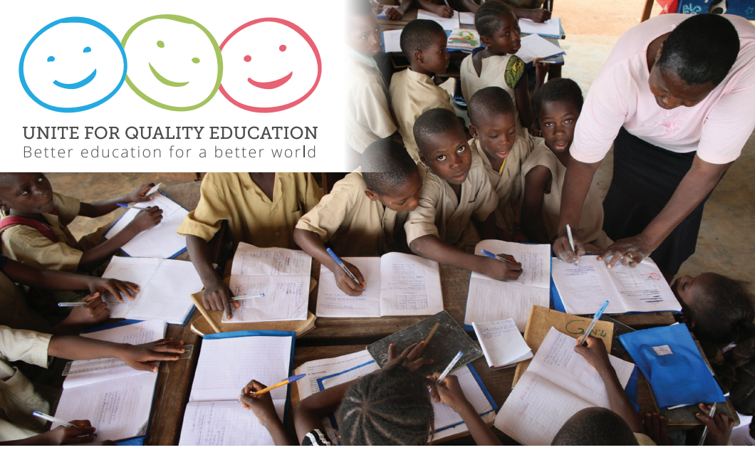
School in Africa

The purpose is to demand that inter-governmental agencies, governments and public education authorities everywhere put in place the three essential elements of a quality education: