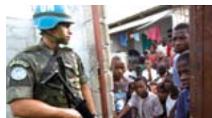
UN guards a school in Haiti

The international community shall assist in ending impunity for attacks on education, and bring those culpable to justice. It will ensure that humanitarian and human rights instruments are used to prosecute perpetrators of attacks on schools, colleges, universities, education offices, and other education facilities; and perpetrators of attacks on students, teachers, academics, education support staff, education officials, education trade unionists and education aid workers. This explicit focus on attacks on students and staff in addition to buildings and facilities must also be included in the investigations of the International Criminal Court and the UN Secretary General’s monitoring of the grave violations against children in armed conflict.