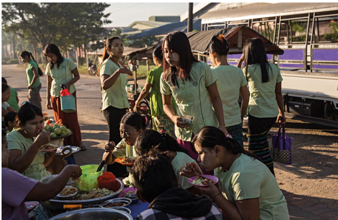
Garment workers eat breakfast at a small stand.