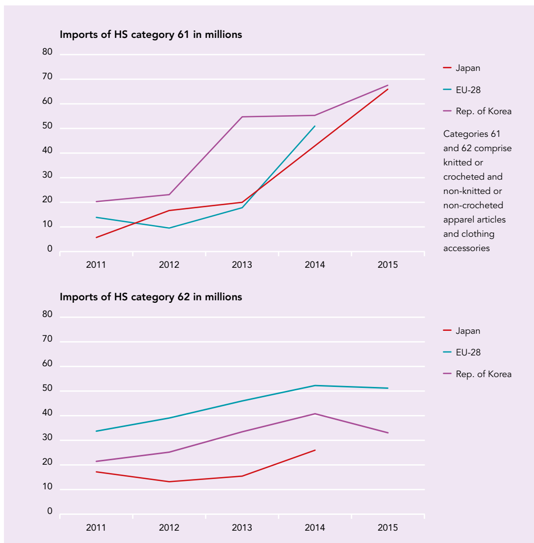
Figure 1 Imports of HS category 61 and 62 from Myanmar

Source: UN Comtrade Database https://comtrade.un.org/data/ 133