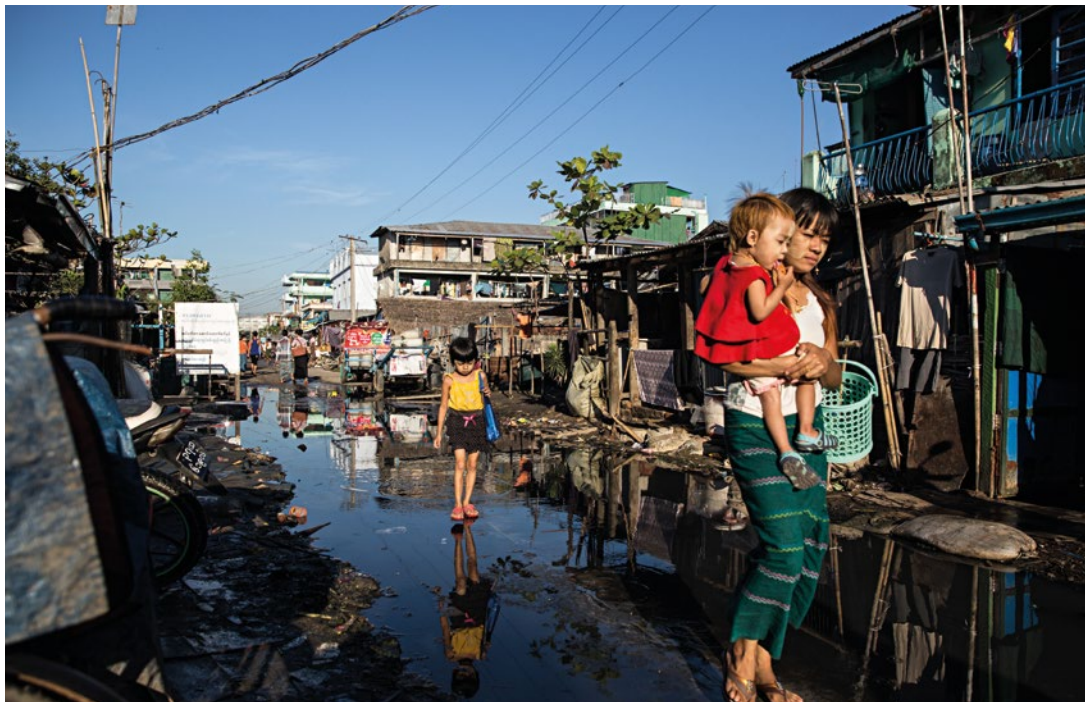
A woman and children walk down the flooded streets of Yangon's Hlaing Tharyar industrial Zone, an area that houses many garment factory workers.

Moreover, the current administration relies heavily on civil servants who served under the previous government – including, for example, the Director General and the Secretary of the Ministry of Labour. District and township level dispute handling bodies are also still run by civil servants who have been in post since the days of the military regime.