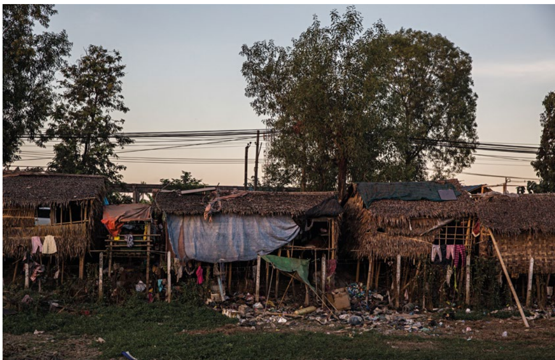
Squatter area for garment factory workers.

include risks related to land grabbing, questionable ownership and military influence, the powerful presence of foreign-owned garment factories, child labour and the position of ethnic workers.