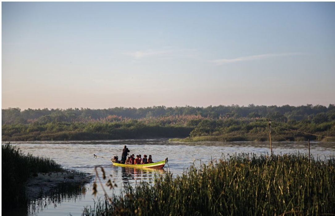
Garment factory workers travel by boat to work in the morning from a small village across the canal.

supplier list mentioned a number of factory names that no longer appear on the December 2016 version. According to C&A, one of the factories could not meet C&A's delivery deadlines. At two other factories, production was suspended due to poor audit results.