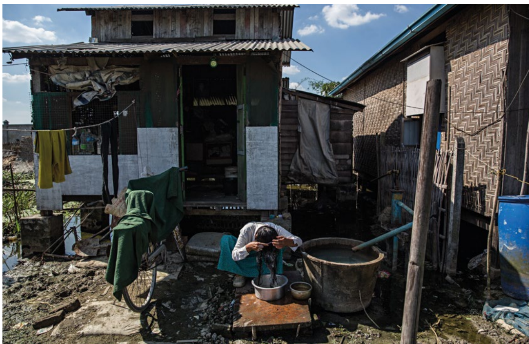
A woman washes her hair outside of her home in a squatter village where many garment factory workers live.