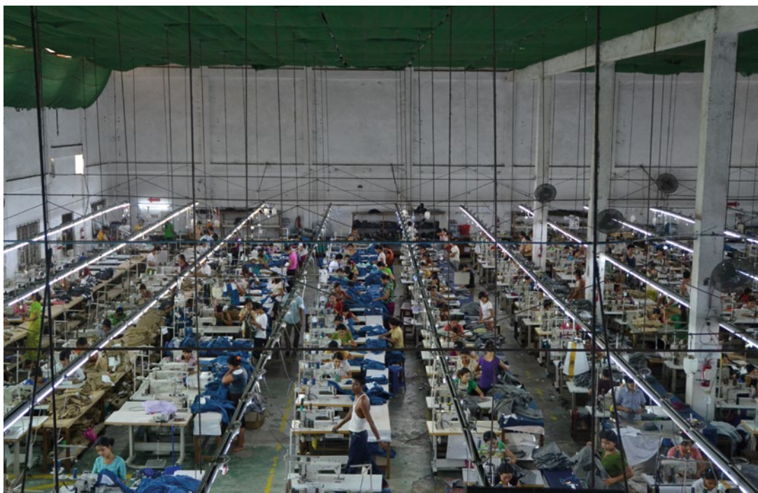
A garment factory in Myanmar (this factory was not included in the research).

and dispute settlement and the presence of labour unions and CSOs, the SEZs have special rules. Human rights and labour rights are not necessarily well served in these zones.