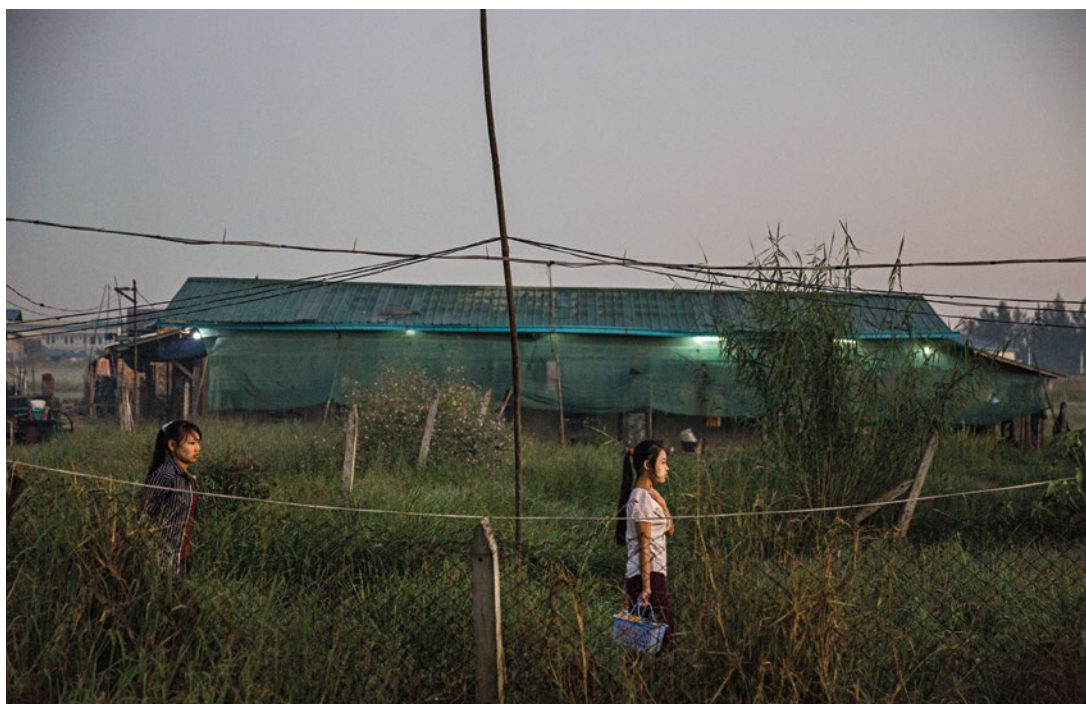
Garment factory workers walk down the footpath near their home on their way to work. Lauren DeCicca