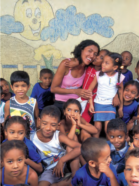
Teachers who love and respect their students make children happy and motivated (Brazil)

Other reasons mentioned by stakeholders for the current absence of a national CP in Brazil include: