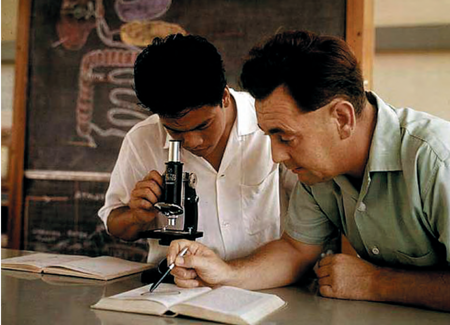
A competent teacher is passionate about teaching and embraces new knowledge (Malaysia)

The majority of teachers say that the competences described in the LNPT do not include some essential qualities a good teacher should have. Besides, they explain, some of the competences may be difficult, if not impossible, for teachers to work in accordance with. Take for example 'interactive teaching methodology'. A teacher: