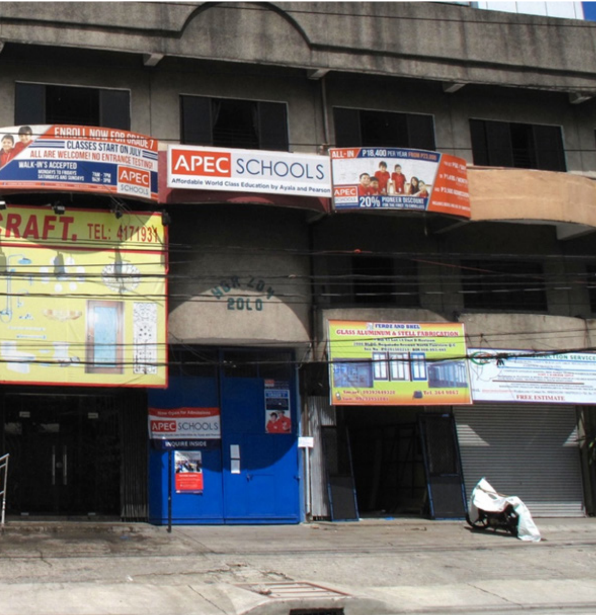
Figure 4: APEC school on second on second level of street-side commercial property.