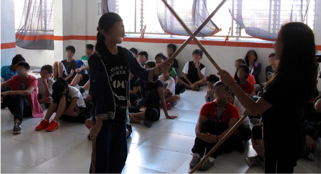
Figure 2: Physical Education, and its discontents, in an unfit APEC schoolroom.