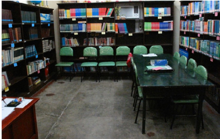
Figure 3: APEC school "library" (on the left) compared to a public school Library (on the right) in the same community in Manila.