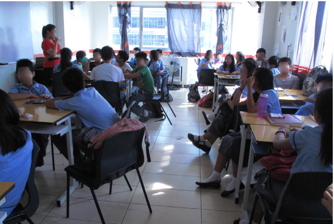
Figure 1: Inside an APEC classroom.

According to this stipulation, therefore, the determination of APEC school facilities by DepED are to be based on the conditions set forth by APEC and not DepED regulations. This is highly problematic since it gives APEC permission to continue their for-profit schooling venture in commercial facilities that may be deemed inadequate according to DepED regulations. Below are photos taken of APEC school facilities in June, 2015.