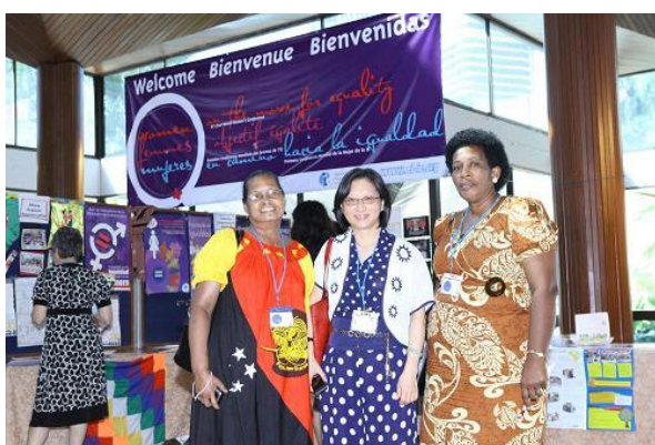
Participants in the exhibition space

Nearly half of the 49 participants from Africa were members of the Africa Women's Education Network (AWEN). The Asia-Pacific region, the most populous and diverse region amongst EI regions, was represented by 170 participants, almost a third of whom were members of one of the sub-regional networks, ASEAN, SAARC or COPE. European EI member organisations participated in the Conference with 89, a third of these participants being active in the ETUCE Women's Network. The North America and Caribbean region was represented by 33 participants, five of whom came from the Caribbean Union of Teachers Status of Women Committee. Almost all of the 21 participants from Latin America were members of the Education Workers Women's Network; the Middle East and North Africa region was represented by six participants.