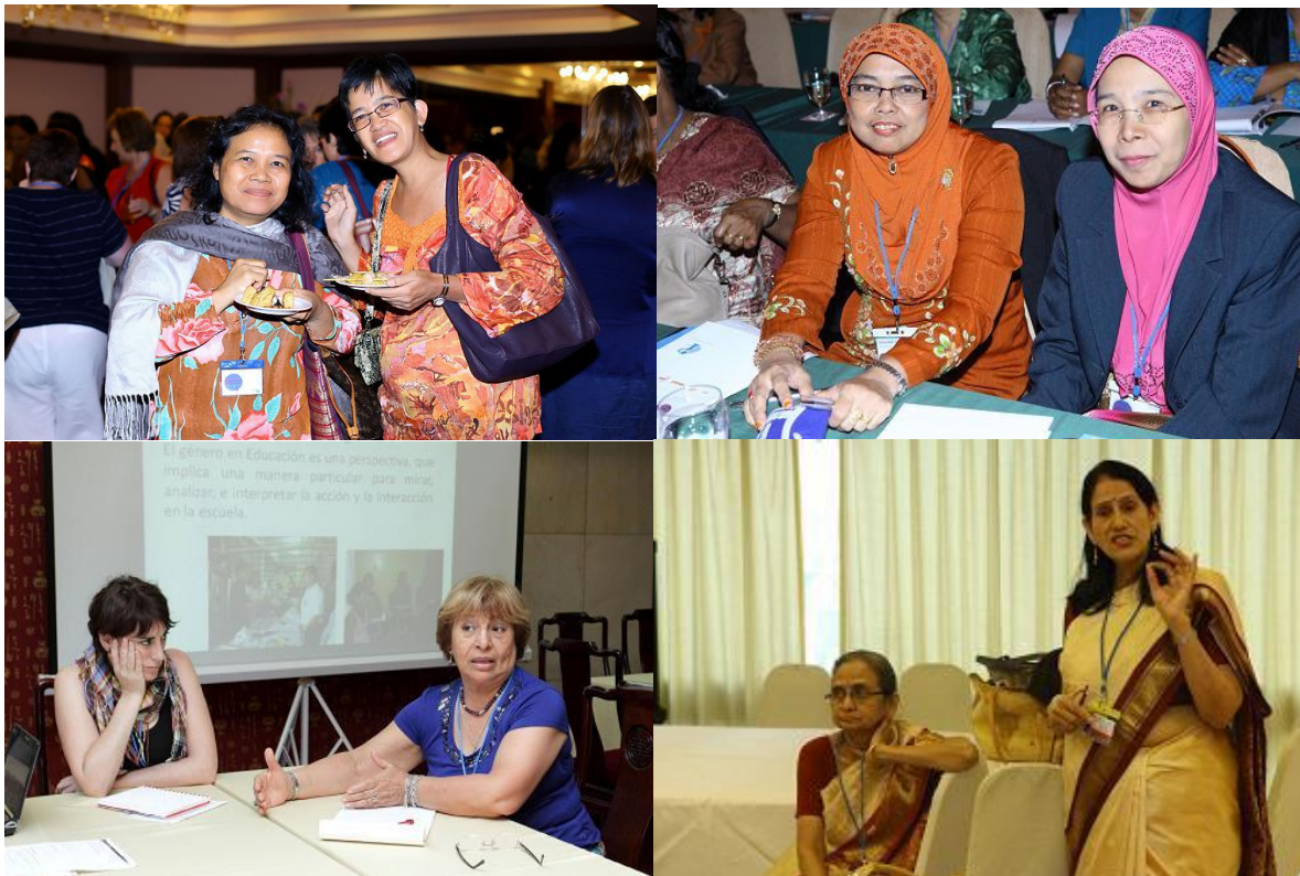
Participants during the opening reception and workshops