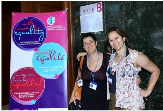
Participants next to the Conference banner in front of the plenary hall