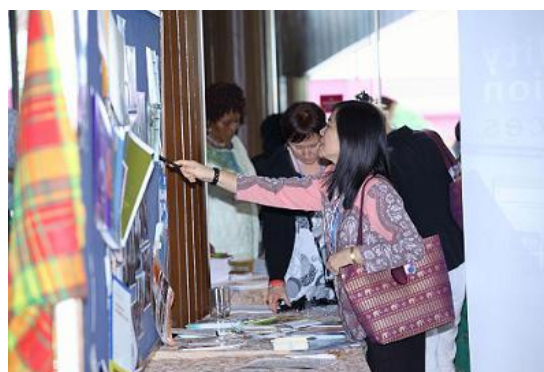
Participant looking at exhibition material

One other space for member organisations to share their experiences and inspiration for their activities was the Exhibition area, which gave the participants the opportunity to display materials of their unions' activities and campaigns. Fifteen tables and ten notice boards overflowed with leaflets, brochures, t-shirts, stickers, buttons, banners, posters and photos of gender equality campaigns, actions and research performed by EI and its member organisations and its networks. The UN Girls' Education Initiative and UNESCO also provided publications, quickly collected by the participants.