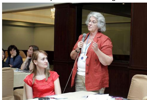
Discussions in the network meetings

It is clear that the financial crisis and economic recession has significantly impacted the provision of quality education in many places, and has served to set-back the pace of change for equality. Also clear from participants is the impact of the food security and climate change crises on achieving equality and quality education for all throughout life.