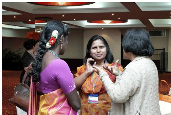
Participants discussing during workshop break

The On the Move for Equality conference did provide the space and opportunity for participants to share and contribute to a forum, the outcomes of which will inform EI’s work on gender in the years to come. It will provide a basis for discussion at the 6th World Congress, to be held in Cape Town, South Africa, in July 2011, with consideration of the resolution on Gender Equality providing the starting point for the development of an EI Global Action Plan “ On the Move for Equality ”, aimed at setting the priorities and main areas of action for the next quadrennium period.