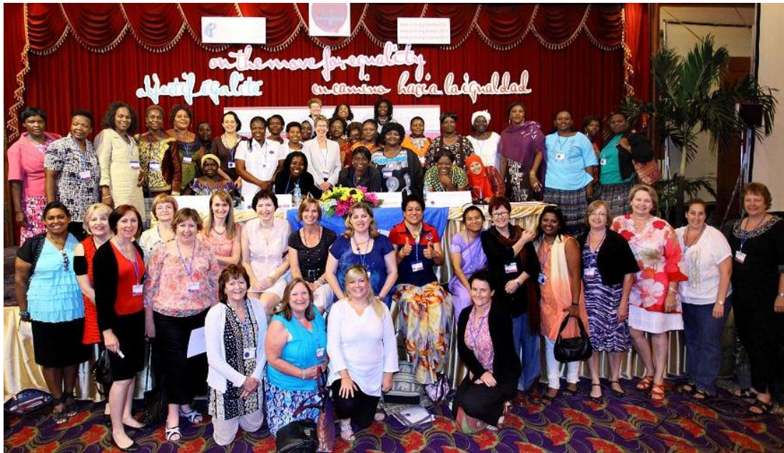
Some of the enthusiastic participants posing for a group photo