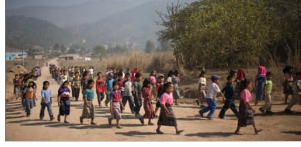
Children walk to their rural school in Xicalcal village in Guatemala

Teachers have played a key role in the fight for freedom in Guatemala. The strikes held by teachers and university students in the capital in 1944 triggered the 'October Revolution', which overthrew the de facto government and led to the first democratic elections in the country's history. A period of change began, during which STEG was created,