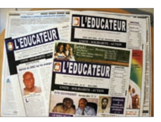
The new SNEC magazine

At the turn of the new millennium, two El member organisations, the OAJ and UNSA-Education embarked on a development co-operation project with an El counterpart in Mali - the Syndicat National de l'Education et de la Culture (SNEC).