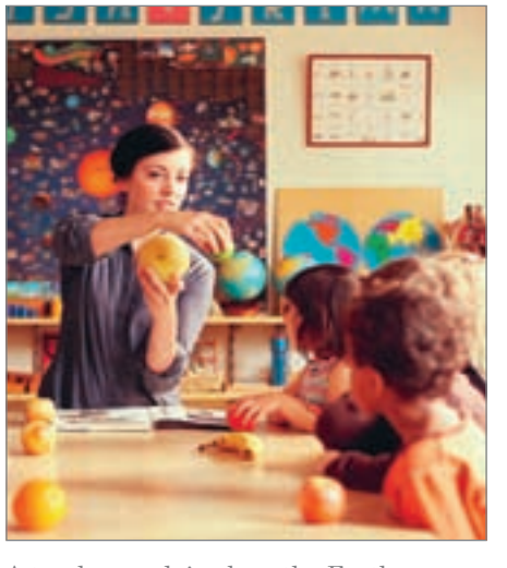
A teacher explains how the Earth moves

Lärarförbundet's support for people's right to education goes beyond its own borders and is carried out in collaboration with teachers' unions in other countries. At the Dakar meeting in 2000, Sweden was among the countries that promised to contribute the necessary funding to deliver EFA. Sweden is performing well in