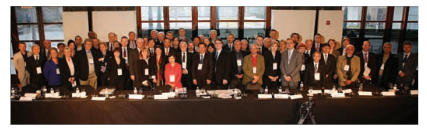
Education ministers and trade union leaders assemble in New York

included because it did not meet the OECD's criteria of 'high performing and rapidly improving education systems'. This decision was regretted because Sweden's approach to teacher involvement and its pay system was continually referenced in the OECD's background paper. Organisations such as the ILO and World Bank also attended the Summit.