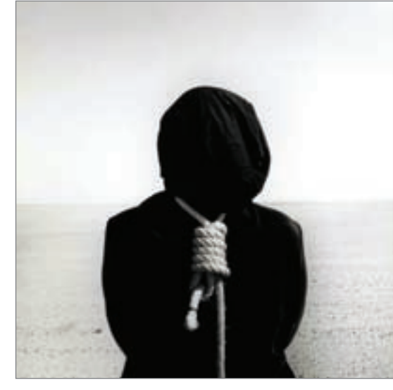
'Anonymous' from Sudan is a human rights defender featured in Kerry Kennedy's book

In September 2010, the NYSUT and Kennedy Centre announced the 'Challenge to End Child Labour' initiative where school children were challenged to fight child labour in the cocoa industry in West Africa. Hundreds of participants in the challenge were recognised at the 10 December launch event, which showed the film The Dark Side of