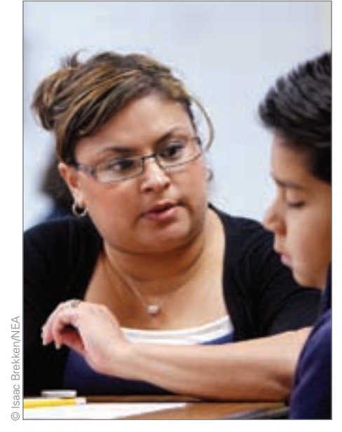
Trained teachers lift student performance

In south Indiana, along the Ohio River, the Evansville Teachers' Association