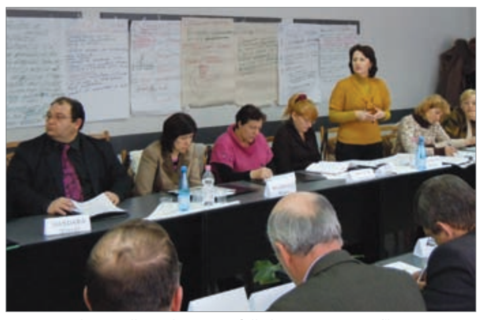
Participants discuss collective bargaining skills during a seminar in Chisinau

The 25 participants that took part in the training responded with thoughtprovoking and insightful feedback to the items discussed during the sessions. They recognised that industrial relations do not yet function properly in their country, and that the Union needs to intensify its efforts to lobby at different levels of local and national structures in order to promote good partnership. They also concluded that one of the first steps