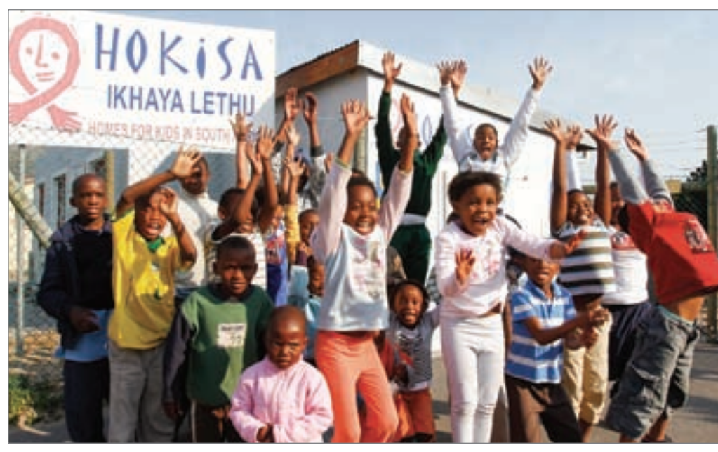
HOKISA gives orphaned children a safe 'family' life

The nurturing continues as the children grow older. Once they reach an age where they can live independently as responsible adults, they have the chance to move into 'Peace House', which is also in Masi, and where HOKISA staff offer support and friendship. The oldest child has now grown up, is living independently in Peace House and has been trained to be a home-based carer. He is fully employed and is giving back to the community that supported him.