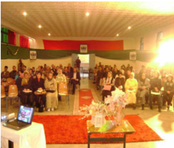
The assistance follows a sketch on Female Teachers' Rights

At Agadir the women desk organised a sensitisation day on the new family code for pupils and female teachers.