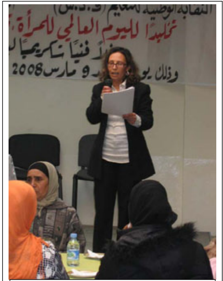
A member of the women department of SNE Morocco addresses women on 8 th Mars 2008