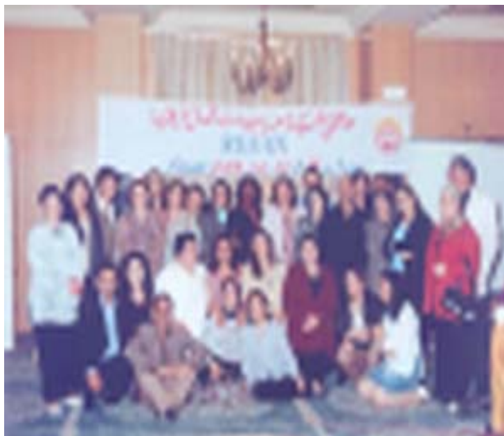
A group photo - Members of SGEB and FGESRS 28th - 30th April 2008