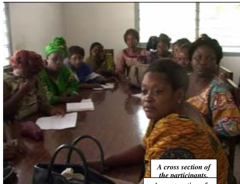
A cross section of the participants.

The General Secretary of FETRASSEIC ceased the opportunity to urge women to further involve themselves into trade union activities. He concluded by asking "who will talk about your rights and who will defend them?"