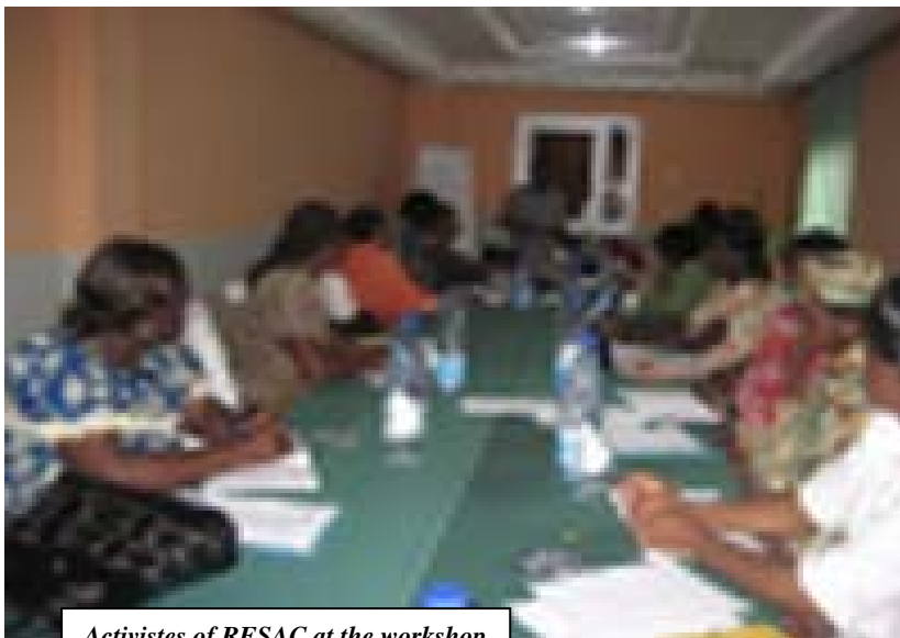
Activistes of RESAC at the workshop

In order to take up the challenges of communication observed during the June 2007 session, a sub-regional training workshop on written communication, ICTs and project management was organised in Douala. It brought together members of