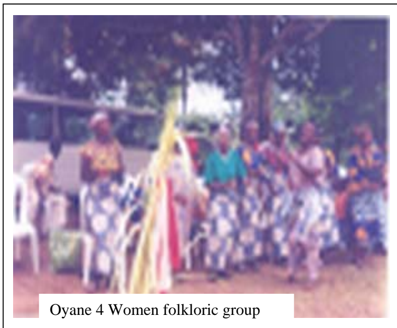
Oyane 4 Women folkloric group

The delegates of FESEENA who were specially invited to the events, seized this opportunity to sensitise their colleagues female teachers of the OYANE 4 Public School on HIV/AIDS.