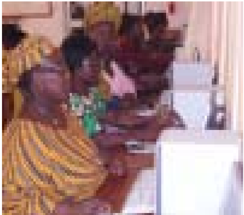
The activists of FESEN in comnuter room

These various activities were carried out in a festive atmosphere and were used to build the capacities of female teachers on the major themes related to development and the challenges of information and communication technologies.