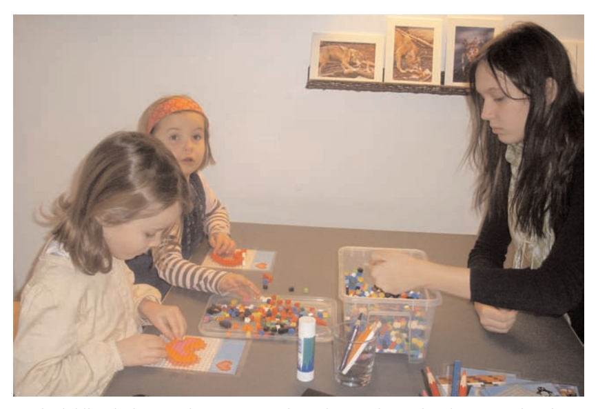
Early childhood education has enormous physical, mental, social and economic benefits.

Europe has changed significantly since 1996 and is now more diverse than ever. At its centre, the European Union now comprises 27 member States, with three more countries awaiting accession in the near future. While the European Union may be the most visible expression of Europe as a political entity, many more countries, from Iceland and Norway to the north, Albania and Bosnia and Herzegovina to the south-east, to Russia and Ukraine to the east, are contributing to Europe's diversity (European Communities, 2009). Its diversity is reflected in a wealth of traditions, experiences, practices and aspirations within Europe on the whole and within its individual countries, at regional and sometimes municipal level. While being a major asset for the future development of the European Union, as well as for its role in the global context, Europe's diversity is also reflected in stark inequalities in and between its countries and regions. Not only are life situations different — and inequitable to a large extent — for children and families from Romania to Sweden, from France to Estonia. Diversity and inequity is also a common pattern within countries.