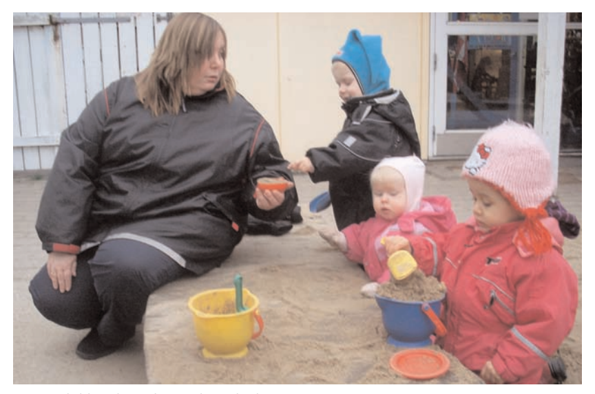
Young children learn better through play.

children in different parts of the world, where water is a limited resource and where they may have to walk far to get water. Likewise we make sure to switch off the lights when we are not present in a room in order to "save electricity". When children are drawing we try to make them aware of the fact that paper comes from our trees and that we must not waste paper if we want to preserve the forests. We buy fruits and vegetables from a local shop close to the pre-school and talk to children about what gains we make in doing so.