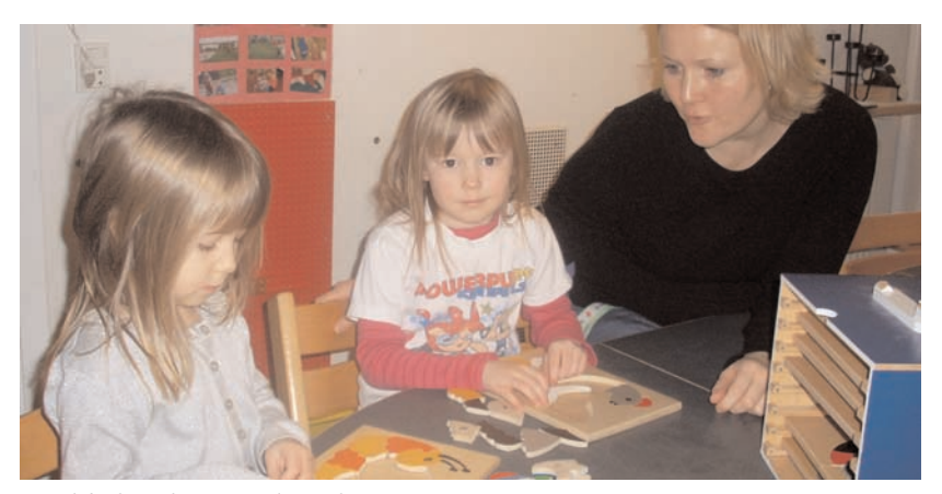
Qualified teachers provide quality ECE services.

be underestimated, there are other reasons, too, for keeping the early child-hood workforce on the European policy agenda. Cameron and Moss, in their study on Care Work in Europe (2007), demonstrate that "the EU sees care work not only as a pre-condition for increased employment, but also as a source of that employment. Between 1980 and 1996 service sector employment in the EU increased by around 19 million (p. 4). The European Commission (1999) has identified care work and education as two of five growth sectors (the other three being business activities, hotels and restaurants and retail trade).