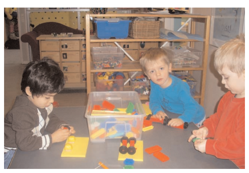
Early childhood education should be every child's right.

The projects presented in the previous section differ in many respects. Some of them, for example Korak Po Korak in Croatia and the Comenius Foundation for Child Development in Poland, work across the entire early childhood system in their countries. They are influencing policies at national level, organising training and professional development and, at the same time, providing services at local level