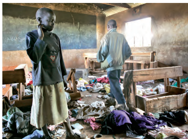
A Kenyan school damaged in post-election violence

and adults to a safe education in a peaceful learning environment, and to respect education institutions as safe sanctuaries. To this end it urges the United Nations Security Council to commission the creation of an international symbol for use on education buildings and education transport facilities to encourage recognition that they should be treated as safe sanctuaries and should not be targeted.