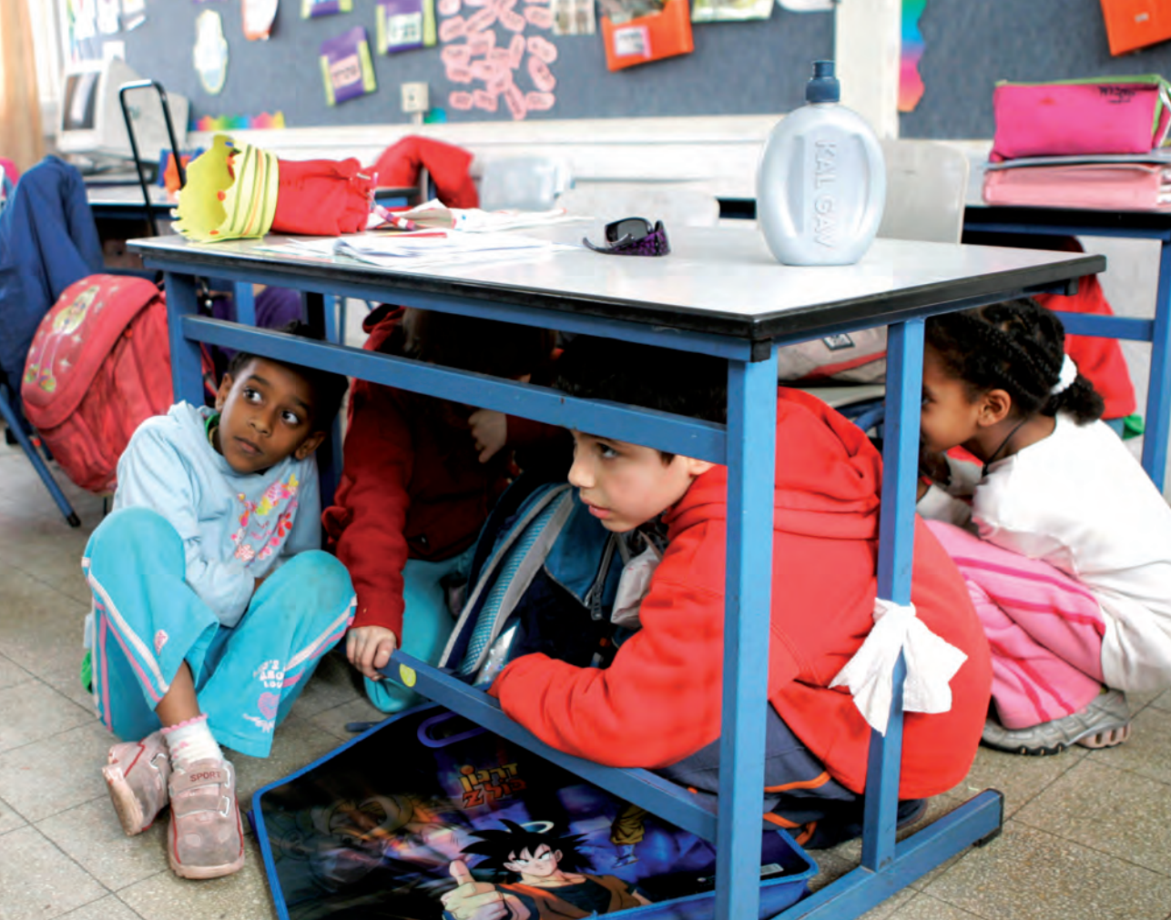
Israeli first grade students practise an emergency drill in case of rocket attacks on their school in Ashkelon

education institutions; and to monitor efforts to end impunity for all attacks. The international community calls on the UN Security Council to support such efforts, as a means of encouraging further action to prevent attacks on education.