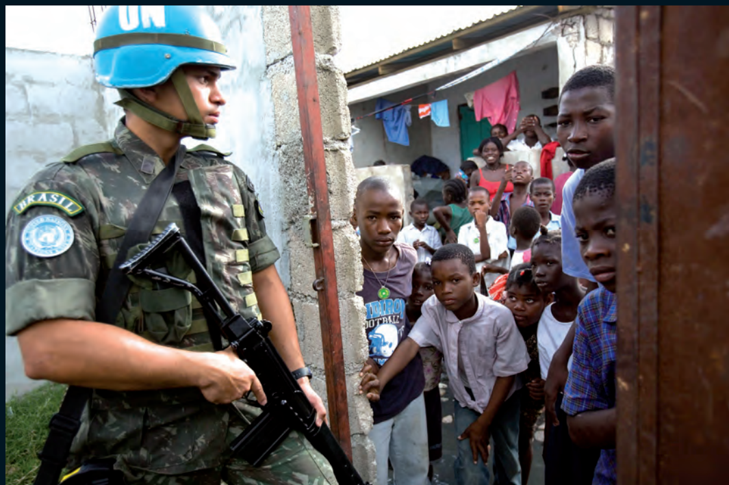
A peacekeeper stands guard as children wait outside a school in Cité-Soleil, Port-au-Prince, Haiti